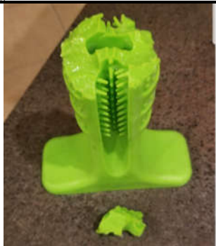
Bristly Knock Off Chewed by Dog