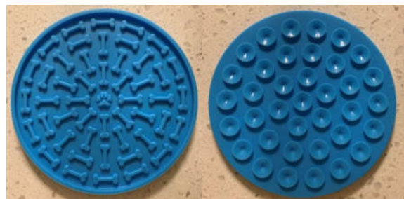
TYPE 3 INFRINGING PRODUCT