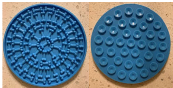
TYPE 1 INFRINGING PRODUCT