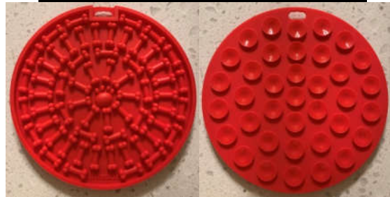
TYPE 2 INFRINGING PRODUCT