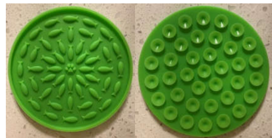
TYPE 6 INFRINGING PRODUCT

18. As poorly designed and manufactured products, Defendants' Infringing Products may injure an unsuspecting pet that tries to ingest it; likewise, the flimsiness of the product may disappoint a customer who may give the product a bad review.