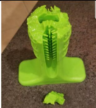
Bristly Knock Off Chewed by Dog