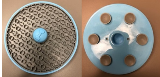
TYPE 4 INFRINGING PRODUCT