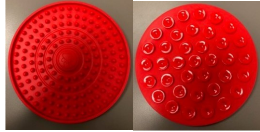
TYPE 6 INFRINGING PRODUCT

See Declaration of Michael Scotese (the "Scotese Dec.") at ¶ 17.