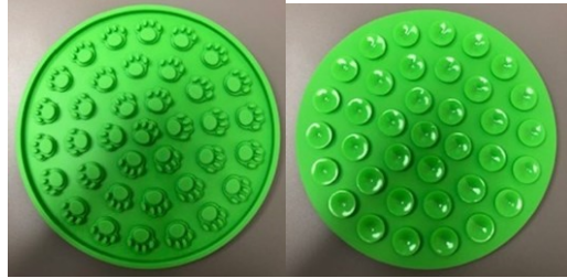
TYPE 3 INFRINGING PRODUCT