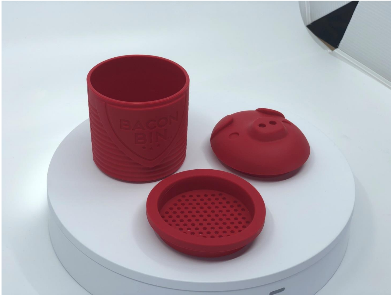
Side View of Authentic Bacon Bin ® molded in Red (Bacon Bin shield is shown on the body)