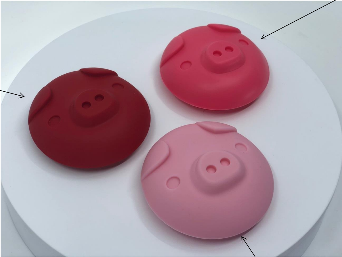
Authentic Bacon Bin ® Piggy Face Sculpted Top