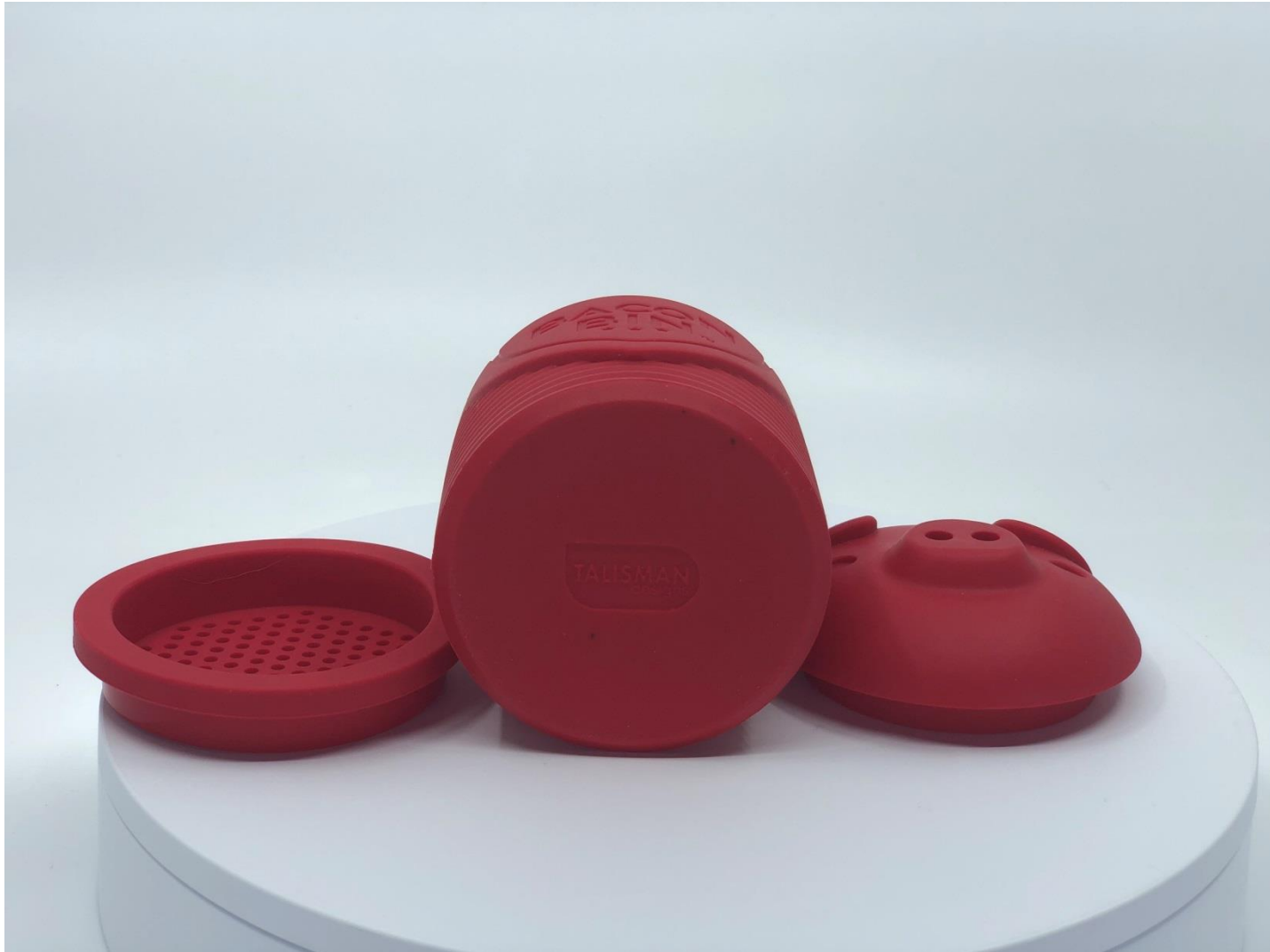
Authentic Bacon Bin ® Bottom View (with Talisman Designs marking)