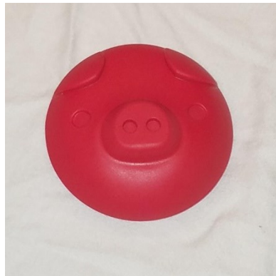
Plaintiff's Copyrighted Sculpture