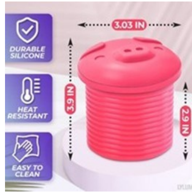
Listing of Defendant New Religion Showing Infringing Sculpture