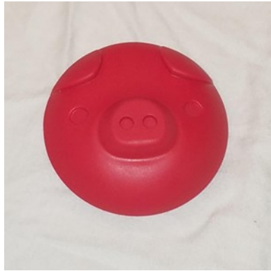
Plaintiff's Copyrighted Sculpture