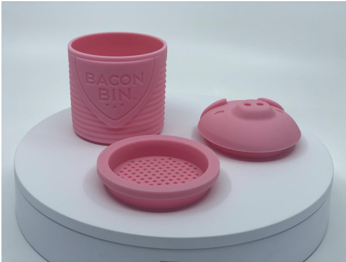
Side View of Authentic Bacon Bin ® molded in Piggy Pink (Bacon Bin shield is shown on body)