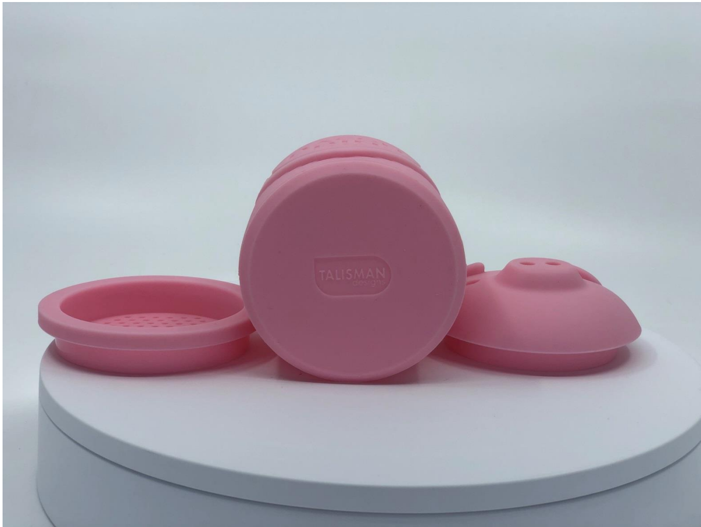
Authentic Bacon Bin ® Bottom View (with Talisman Designs marking)