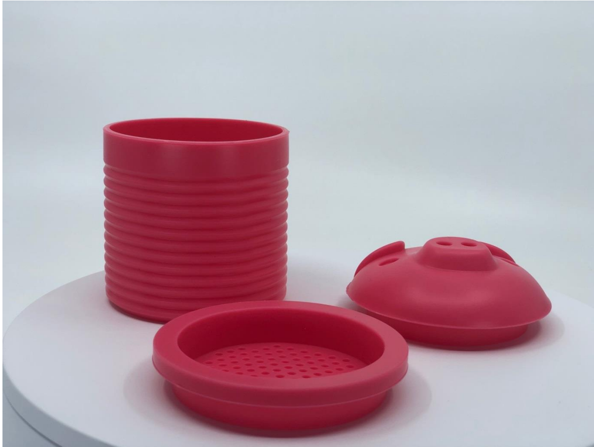
Side View of Infringing Product molded in a color that falls between the Authentic Bacon Bin ® molded in Piggy Pink and the Authentic Bacon Bin ® molded in Red