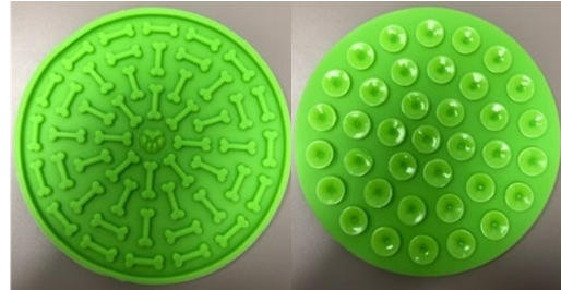
TYPE 2 INFRINGING PRODUCT