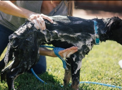
Plaintiff's Copyrighted Photograph