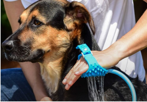
Plaintiff's Copyrighted Photograph