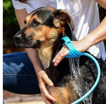
Listing of Defendant ONE PET SUPPLY Store Showing Infringing Photo