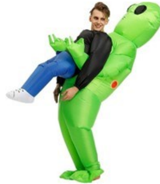
Listing of Defendant lemonseven Showing Infringing Sculpture