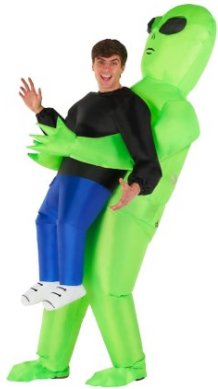
Plaintiff's Copyrighted Sculpture